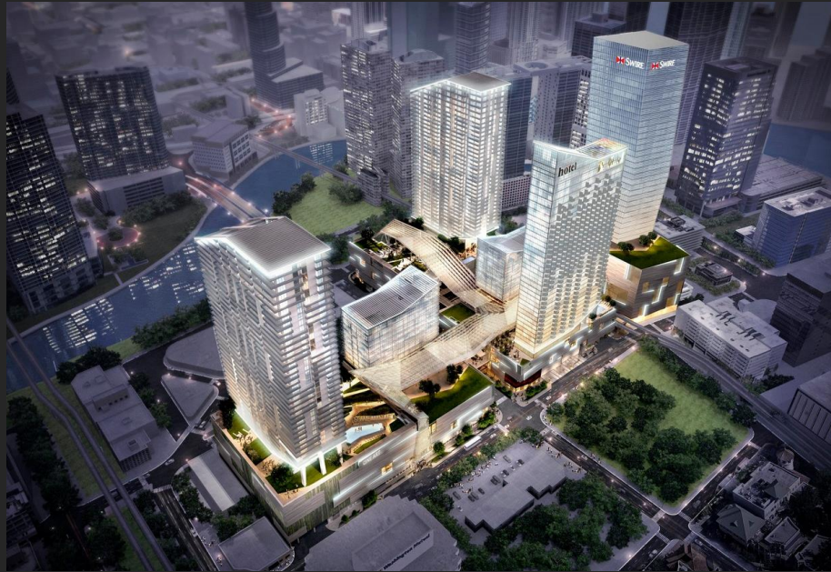
BRICKELL CITY CENTRE