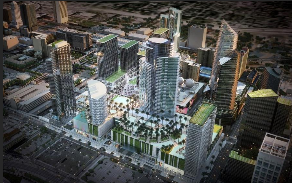
MIAMI WORLD CENTER